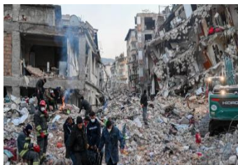
Aftermath of the Syrian Earthquake

The Syrian earthquake caused the death of over 60,000 people, and UN World Food Programme estimated that 18 million people have lost their homes. Jacob's Well has been supporting Samara's Aid in Syria for some time. When Jacob's Well Appeal launched an emergency appeal, £85,000 was raised in 2 weeks. Good quality health care is not available to most of the population, while 60% of the hospitals have been damaged.