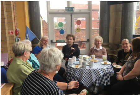
Celebrating Yorkshire Day

We knit, sew, play scrabble or just enjoy each other's company. In winter we opened as a warm space and we continue to welcome everyone who calls in for a cuppa. Come along and join us.