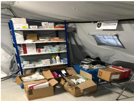
Above: a large tent used as field hospitals in Ukraine

Jacob's Well Appeal continues its work sending aid in the form of medical, household, agricultural, food, educational items and donations of money for projects in various countries.